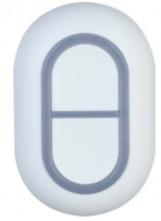
Wireless Panic Button